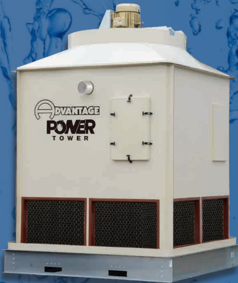
135 Ton Power Tower ® G3 Series

Under design conditions about 1% of the water flow rate evaporates to achieve the cooling affect desired.