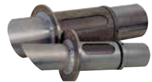
Material probes with adjustable air flow, 1.5" - 4" O.D.

* Choose dry air probe in addition to dry air stub for dry air convey. **Choose dry air stub for dry air conveying in lieu of the standard cartridge filter. Not available on VTB-14-1.