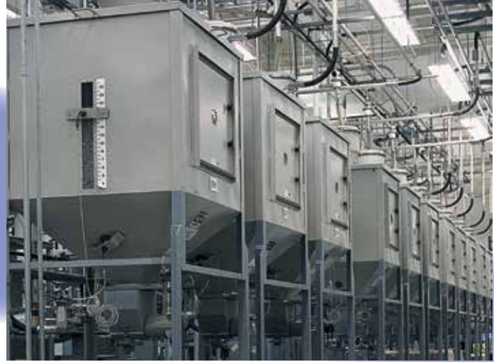
Surge Bin Installation

These bins are ideal for bulk storage of plastic resins prior to processing. They can be fitted with receivers or loaders and take-off boxes.